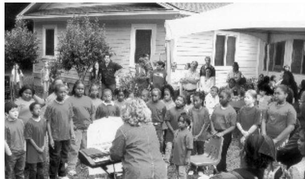
Students from Angel Oak School perform at Craft Fair.