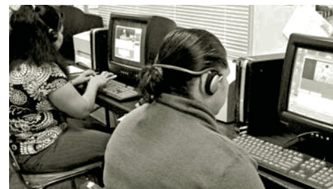
ESL students working with the Rosetta Stone language software

Finally, she got an interview and got a job! When she came to tell us the great news she also told us that she had promised her first paycheck to Our Lady of Mercy