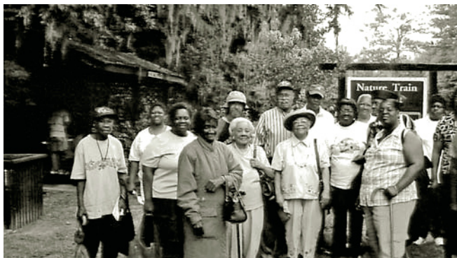
Participants of the Senior Citizens Program at the Neighborhood House enjoy a field trip to Johns Island.

The Neighborhood House serves a hot lunch daily to 150 plus local residents and assists with emergency needs.