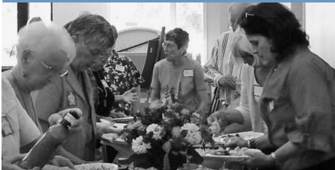
Volunteers who help with direct services, educational programs, and dental care enjoy a well-deserved luncheon in their honor