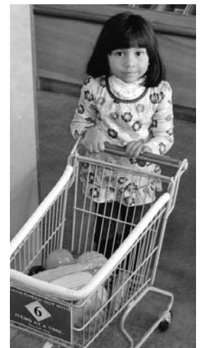
Parents and their children enjoyed a complimentary visit to the Lowcountry Children's Museum.