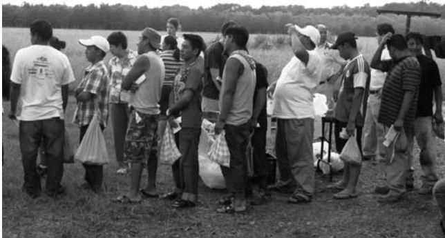
Migrant farm workers wait in line to be seen by volunteer doctors and dentists