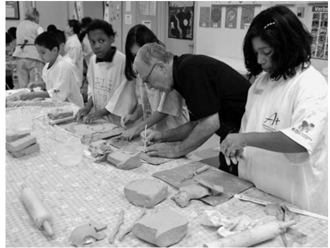
Students enjoyed creating pottery and showing off their tie-up pillows.