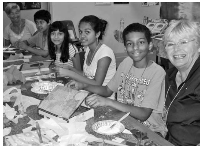
Many local volunteers enjoy a wonderful summer camp at the Outreach with children from the community.

If you would like to be part of the picture at the Outreach by volunteering, call Claire Bergstrom at (843) 559-4109.