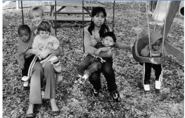
Children (ages 18 months to five years) participate in the Early Childhood Development Program while their parents attend GED classes or the ESL Program.