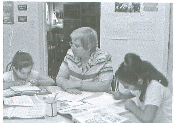
"Yes I Can" after school students

Last year 173 adult students attended a variety of the classes and upon testing received scores 13% higher than the state's average. 73% of the students advanced more than one level in their